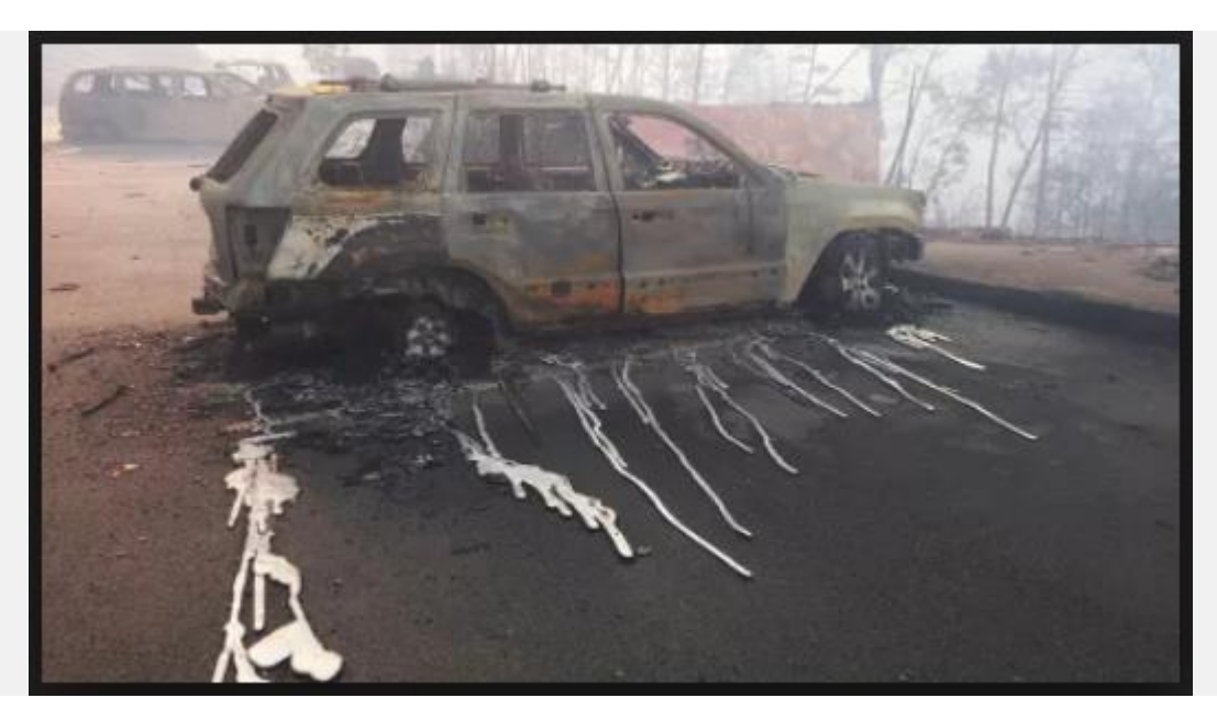
Melted aluminum hub caps in Larkfield, a suburb of Santa Rosa, CA after the 2017 geoengineered firestorms

However, it's in California that the pyro-terrorists really love to test their newfangled pyro-weaponry. See: 500 Trillion Watt Laser Created In California (Video) The hard evidence from last year's apocalyptic CA firestorms proved this fact conclusively. Massive, out-of-control wildfires are even jumping off out of the normal fire season. "Wildfires have never occurred like this in Southern Cal DURING DECEMBER."