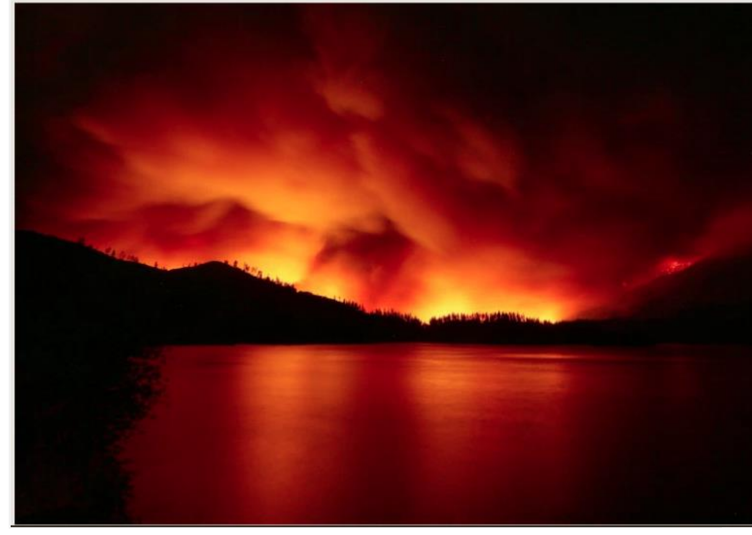
In this photo taken Wednesday, July 25, 2018, a wildfire burns near the lake in Whiskeytown, Calif.