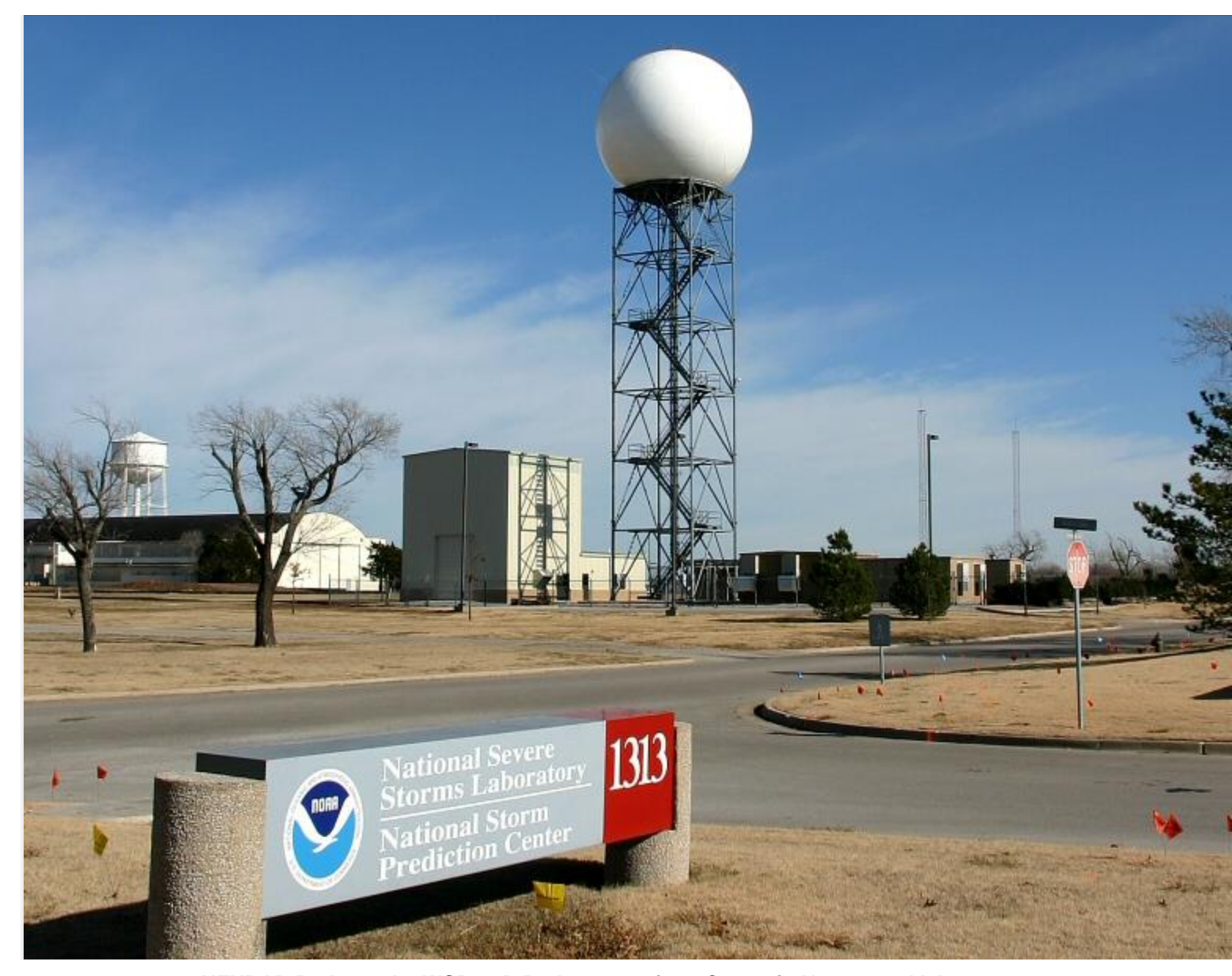
NEXRAD Radar at the WSR-88D Radar Operations Center in Norman, Oklahoma

While one state is experiencing deluge after deluge, another state might be experiencing a 500 year drought. Moisture is often pulled from one geographic area and stationed over another. This is why so much of the USA has been tormented by such wide weather extremes for many years. The geoengineers are constantly experimenting on US and trying out new techniques. Some of these include technologies so advanced they have never been revealed to any party outside of those who developed and utilize them.