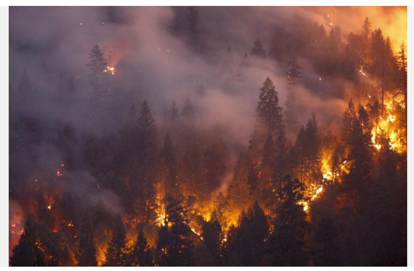
REDDING, CA – JULY 30: Forest burns in the Carr Fire on July 30, 2018 west of Redding, California.