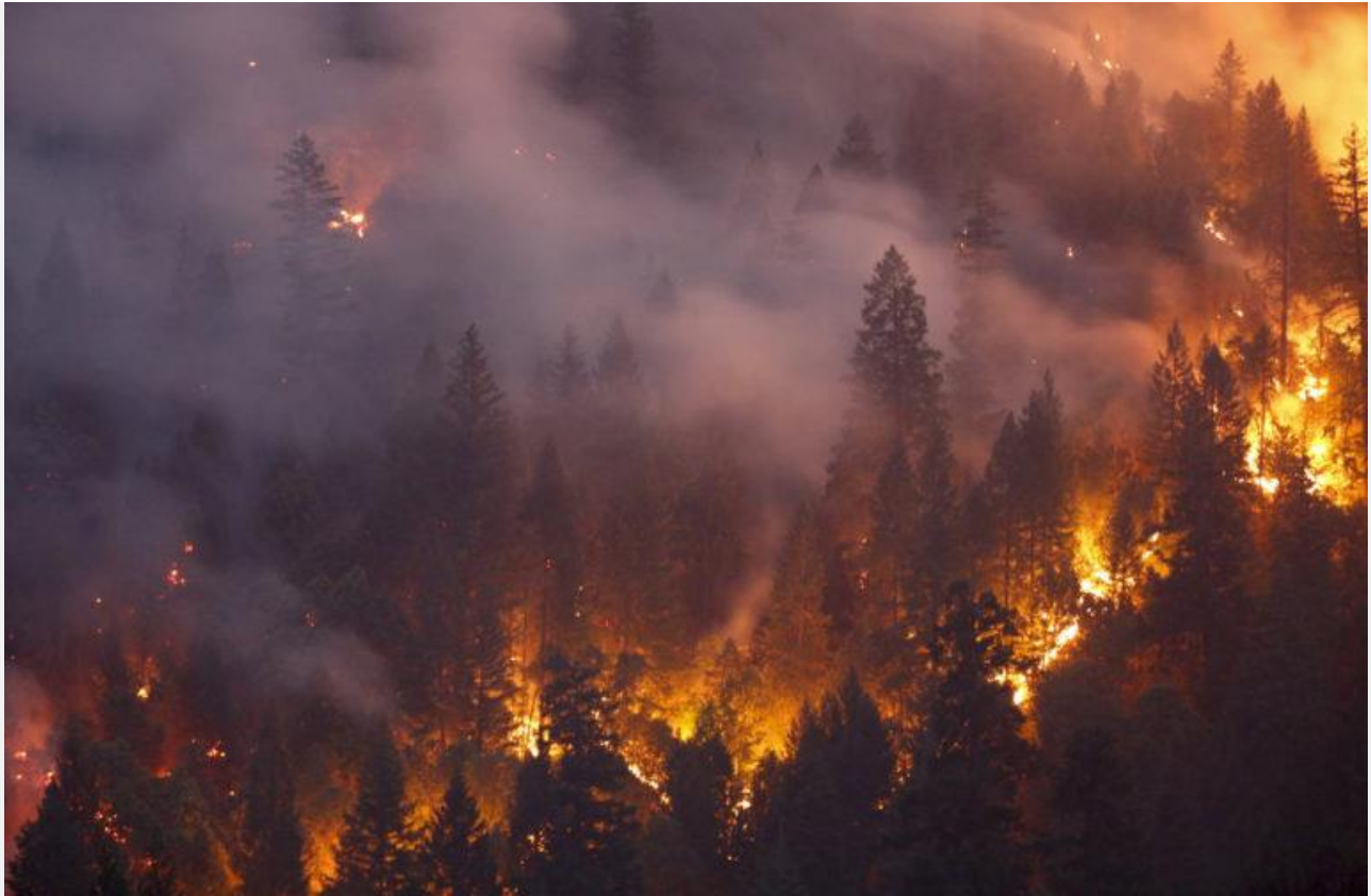
REDDING, CA – JULY 30: Forest burns in the Carr Fire on July 30, 2018 west of Redding, California.