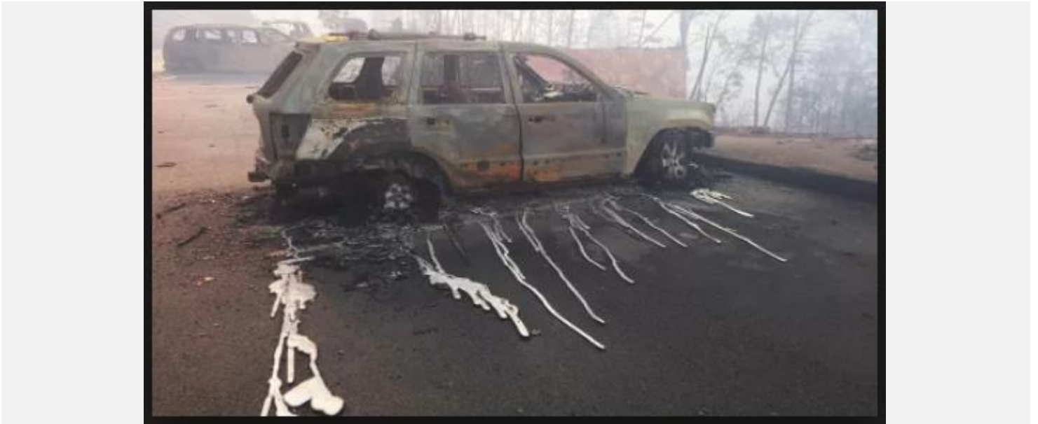
Melted aluminum hub caps in Larkfield, a suburb of Santa Rosa, CA after the 2017 geoen지니어ed firestorms

However, it's in California that the pyro-terrorists really love to test their newfangled pyro-weaponry. See: 500 Trillion Watt Laser Created In California (Video) The hard evidence from last year's apocalyptic CA firestorms proved this fact conclusively. Massive, out-of-control wildfires are even jumping off out of the normal fire season. "Wildfires have never occurred like this in Southern Cal DURING DECEMBER."