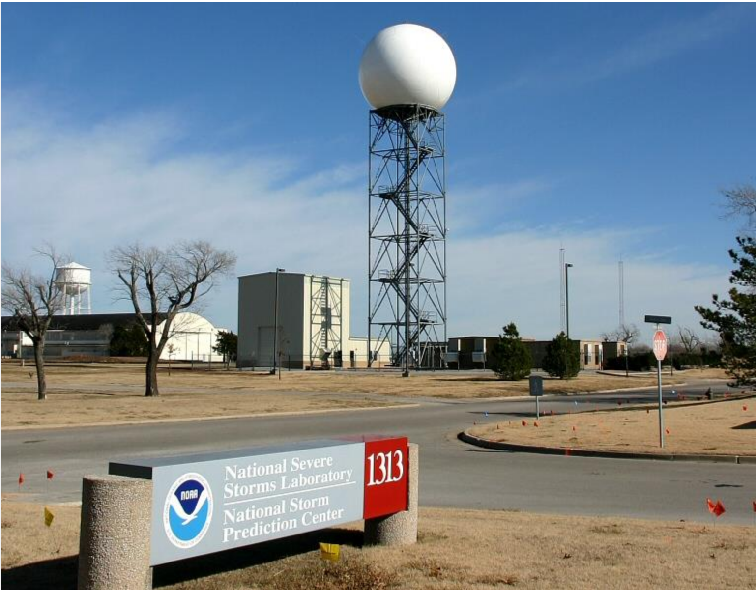
NEXRAD Radar at the WSR-88D Radar Operations Center in Norman, Oklahoma

While one state is experiencing deluge after deluge, another state might be experiencing a 500 year drought. Moisture is often pulled from one geographic area and stationed over another. This is why so much of the USA has been tormented by such wide weather extremes for many years. The geoengineers are constantly experimenting on US and trying out new techniques. Some of these include technologies so advanced they have never been revealed to any party outside of those who developed and utilize them.